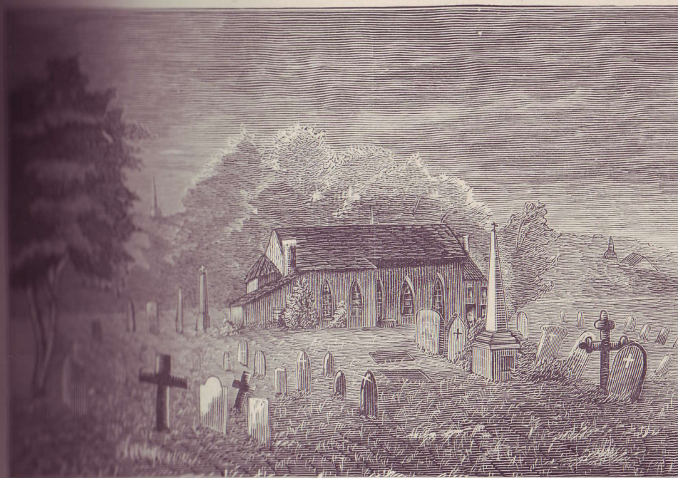
ST. AUGUSTINE'S CHAPEL---OLDEST CHURCH IN ARCHDIOCESE