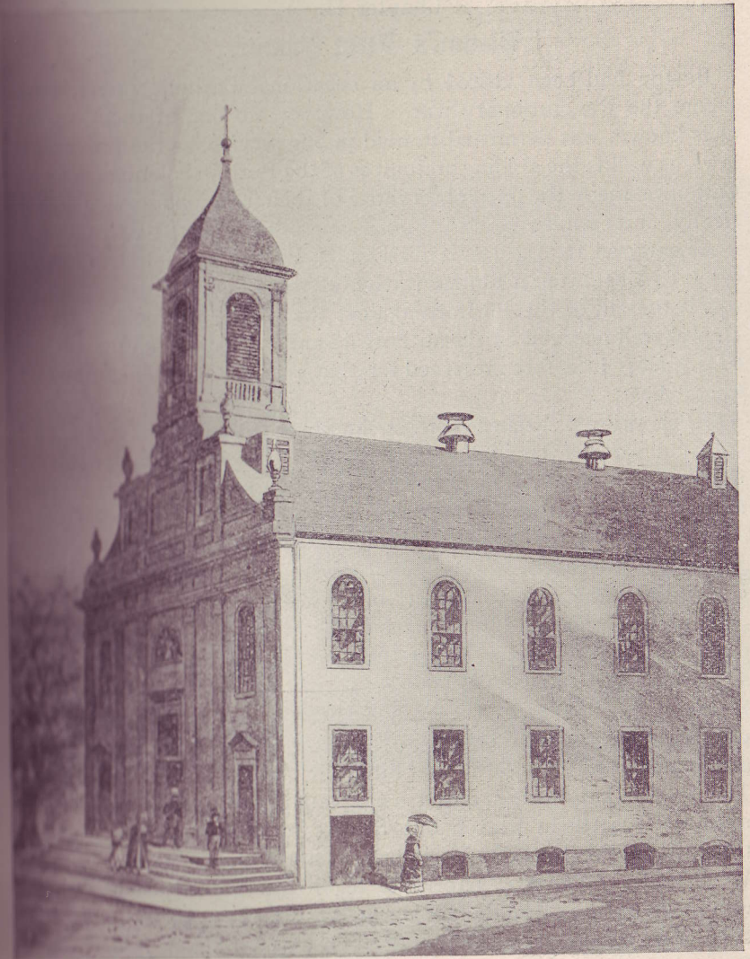
FRANKLIN STREET CATHEDRAL

But God, in His wise Providence, was not unmindful of the difficulties that beset the path of the pioneer priests of the United States. Slowly, but surely, their ceaseless and untiring efforts bore fruit and that abundantly. Every year they managed to visit and administer to the faithful in whatsoever extreme corner of the states they might live. That they suffered untold hardships, we know full well, but they were real apostles seeking God's glory alone and in such a cause, they counted it a privilege to suffer.